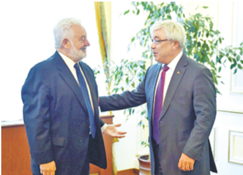
Erlan Idrissov (R) welcomes Vicente Loscertales on Sept. 14.

Loscertales visited the city to inspect the progress on preparations for next year's three months long event. Commending the headway made in attracting countries to participate in the exhibition, he underlined a particular value of an agreement on the privileges and preferences signed between the Kazakh government and BIE.