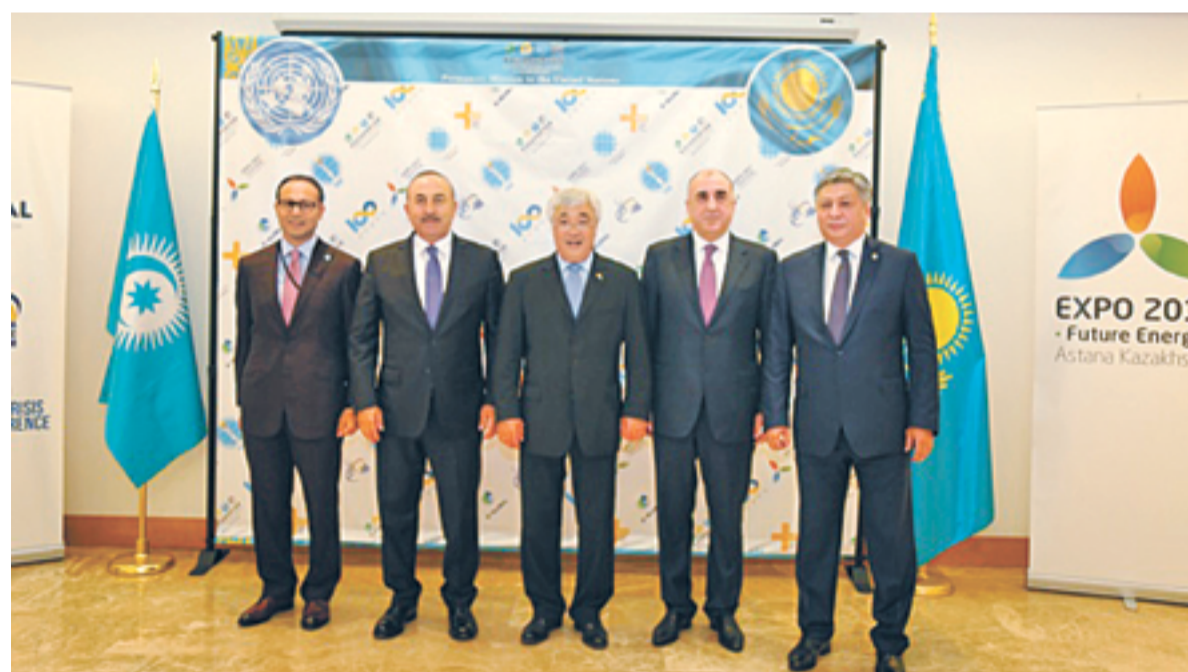
Foreign ministers of four Turkic-speaking states as well as secretary general of the Turkic Council meet in New York on Sept. 20.

part in the ceremony of depositing instruments of ratification of the Paris Climate Change Agreement. Kazakhstan signed this important international document on Aug. 2 and confirmed its commitment to complete the ratification process by the end of this year.