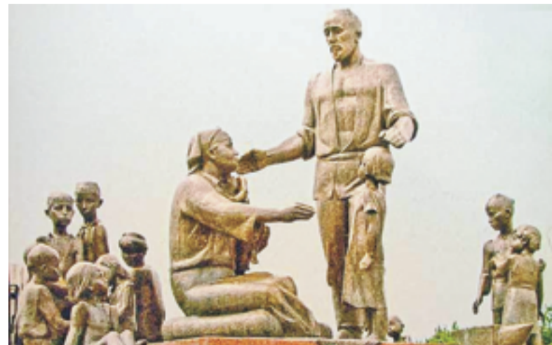
File photo of a similar existing monument in Tashkent, Uzbekistan.

An inscription saying “We fulfilled our destiny due to the Kazakh people. On behalf of all ethnic groups ...” will decorate the front side of the pedestal.