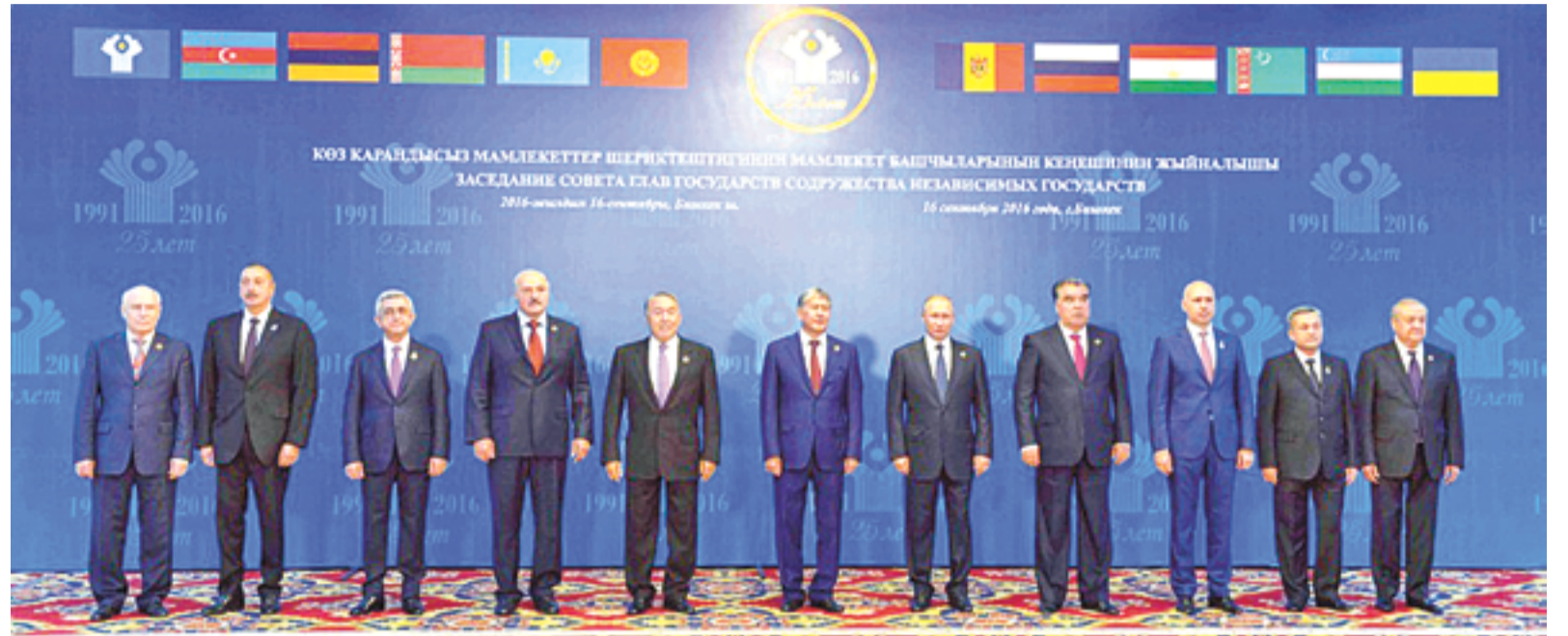
Leaders of the Commonwealth of Independent States meet at the 25th jubilee summit to address the most pressing economic issues on Sept. 16 in Bishkek, Kyrgyzstan.

President of Russia Vladimir Putin and President of Tajikistan Emomali Rahmon, as well as Foreign Minister of Uzbekistan Abdulaziz Kamilov attended the event.