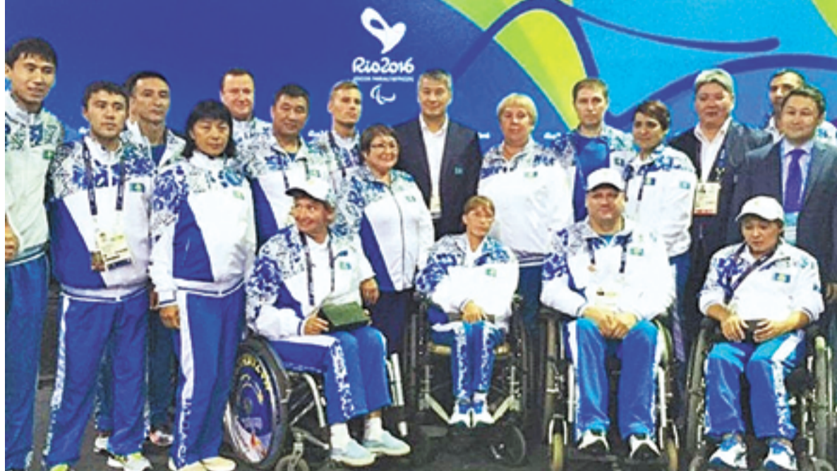
Kazakhstan's national Paralympic team.