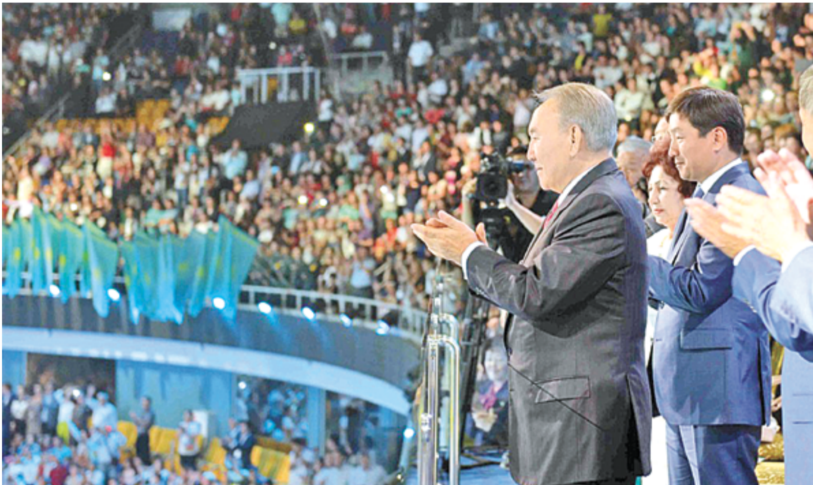
President Nursultan Nazarbayev (C) and Almaty Mayor Bauyrzhan Baibek congratulate more than 7,000 Almaty residents who gathered to celebrate the millennial anniversary on Sept. 18.