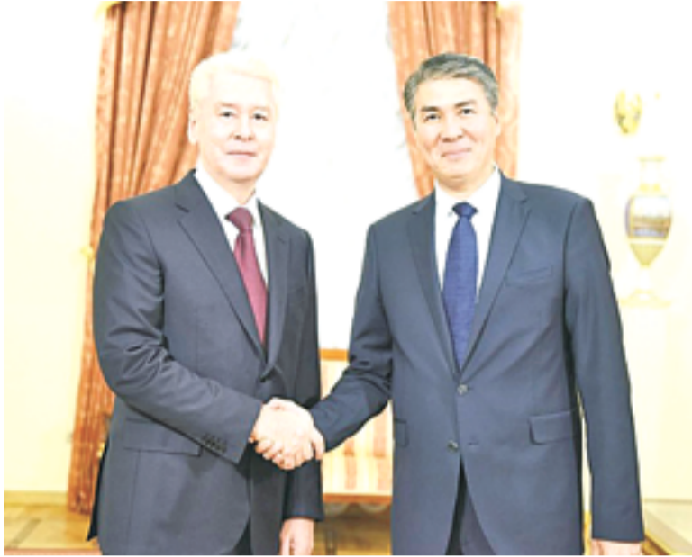
Sergei Sobyenin (L) and Asset Issekeshiev.

"Your city with its rich experience in urban development is important to us," said Astana Akim (Mayor) Asset Issekeshiev at the meeting with Moscow Mayor Sergei Sobyenin. "We are now reviewing the concept of the city's development with an emphasis on the smart city formation, the introduction of new technologies to create a comfortable environment for living. In this regard, we would like to explore Moscow's experience in the fields of urbanisation, urban management, transport systems, urban policy and the construction