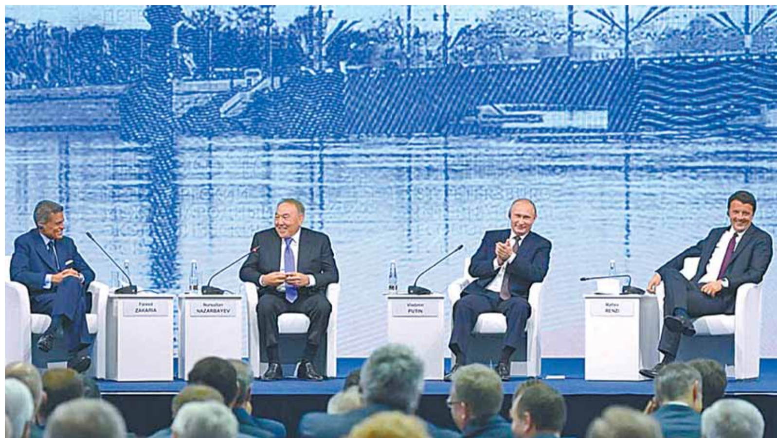
(L-R) CNN Host Fareed Zakaria, Kazakh President Nursultan Nazarbayev, Russian President Vladimir Putin and Italian Prime Minister Matteo Renzi.