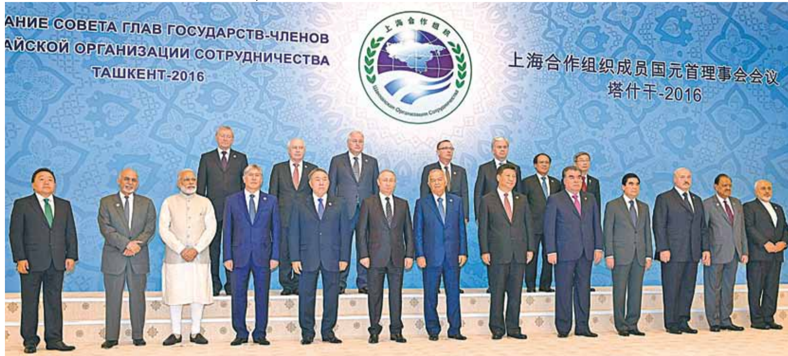
Presidents of the six member states of the Shanghai Cooperation Organisation - China, Kazakhstan, Kyrgyzstan, Russia, Tajikistan, and Uzbekistan - are joined for a group photo by the leaders of Afghanistan, Belarus, India, Mongolia, Pakistan, and Turkmenistan as well as the foreign minister of Iran and representatives of numerous international organisations who are SCO observers and partners for dialogue.