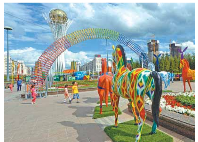
See full story on Page B1.