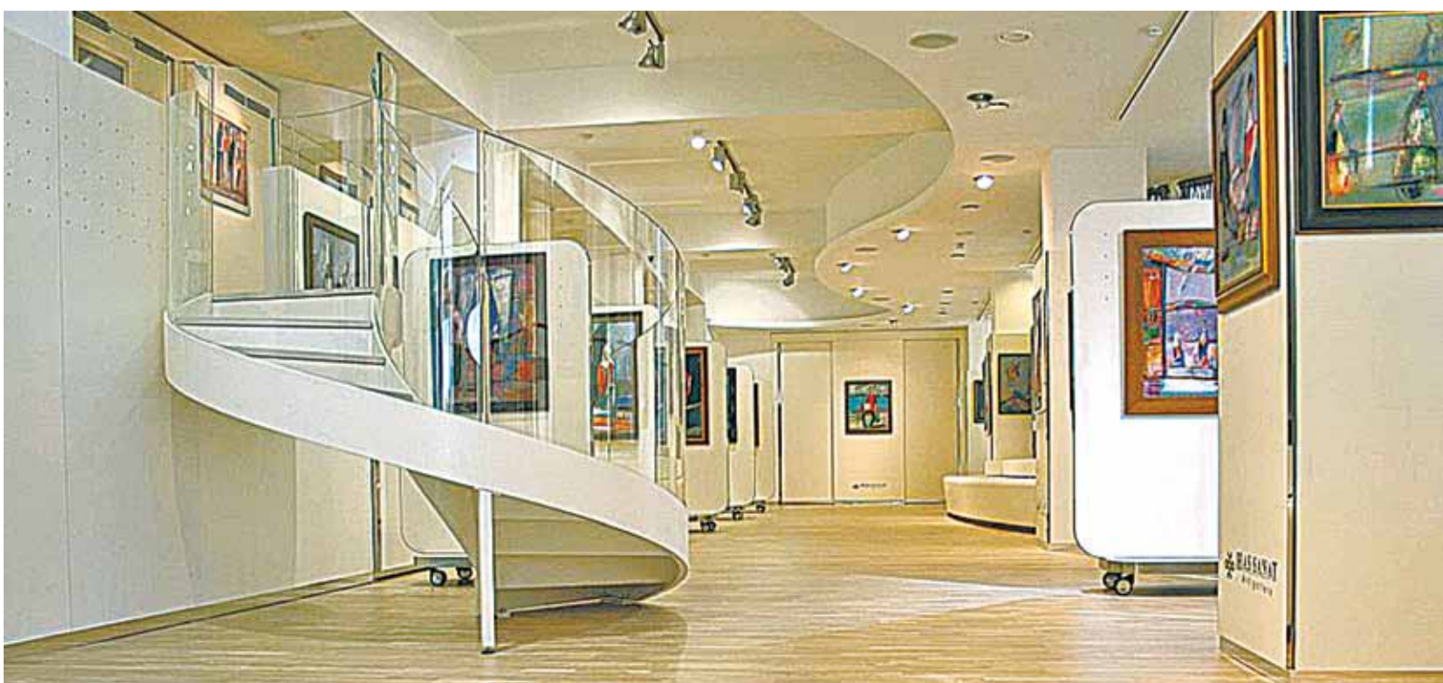
Has Sanat Art Gallery.

The event was held with the support of the Swiss Embassy in Kazakhstan.