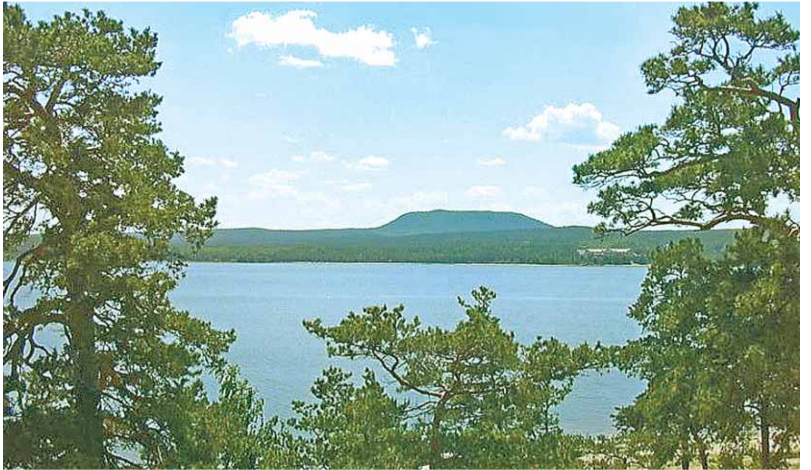
Many Zerenda vacation spots offer health treatments such as mud baths, cedar barrel saunas and baths with herbs and a relaxing massage. It is a great way to not only see the beauty of Kazakhstan, but free the mind and body from everyday stress.

Visitors may also choose Karagaily Holiday Home. The inn has tennis courts, a playground, Finnish sauna with relaxation room, bar, cafe, fishing, crabbing and boats for rent. Accommodations can be in rooms or houses. Prices start at 9,850 tenge (US$29.30) per night for a double room, excluding meals.