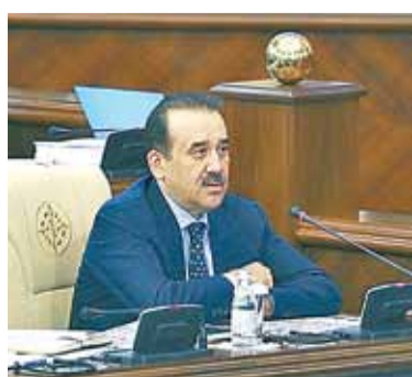
Kazakh economy immediately affect the development of business

According to the prime minister, the budget expenditures due to the high state presence in the