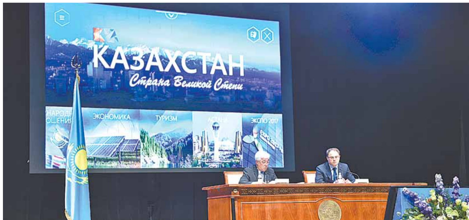
Kazakh Foreign Minister Erlan Idrissov (L) and Deputy Foreign Minister Roman Vassilenko during the presentation of the application.