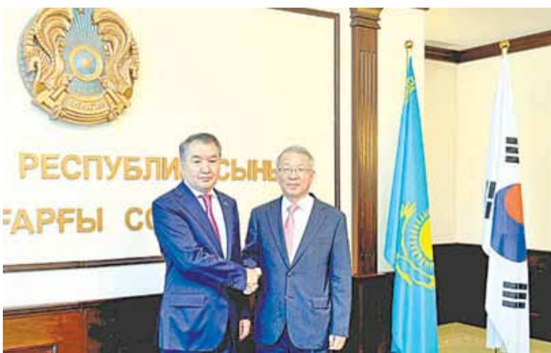
Chairman of Kazakhstan Supreme Court Kairat Mami (L) and Chief Justice of South Korea Yang Sung-tae.

Mami talked about current reforms that are part of the Plan of the Nation's 100 Concrete Steps programme, including the transformation to a three-level system of justice, increasing requirements for judge candidates, extending the powers of investigating judges and reducing the participation of prosecutors in civil proceedings, according to a press release on the meeting. He added that a specialised board on investment issues,