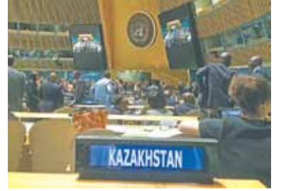
Nameplate for Kazakhstan at the UN General Assembly hall is seen on June 28 during the vote count.

Kazakhstan put forward four priorities for its future work in the UN Security Council: nuclear, energy, water and food security. Advancing