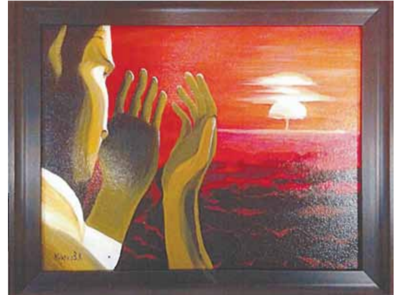
The 'Explosion' by Karipbek Kuyukov.