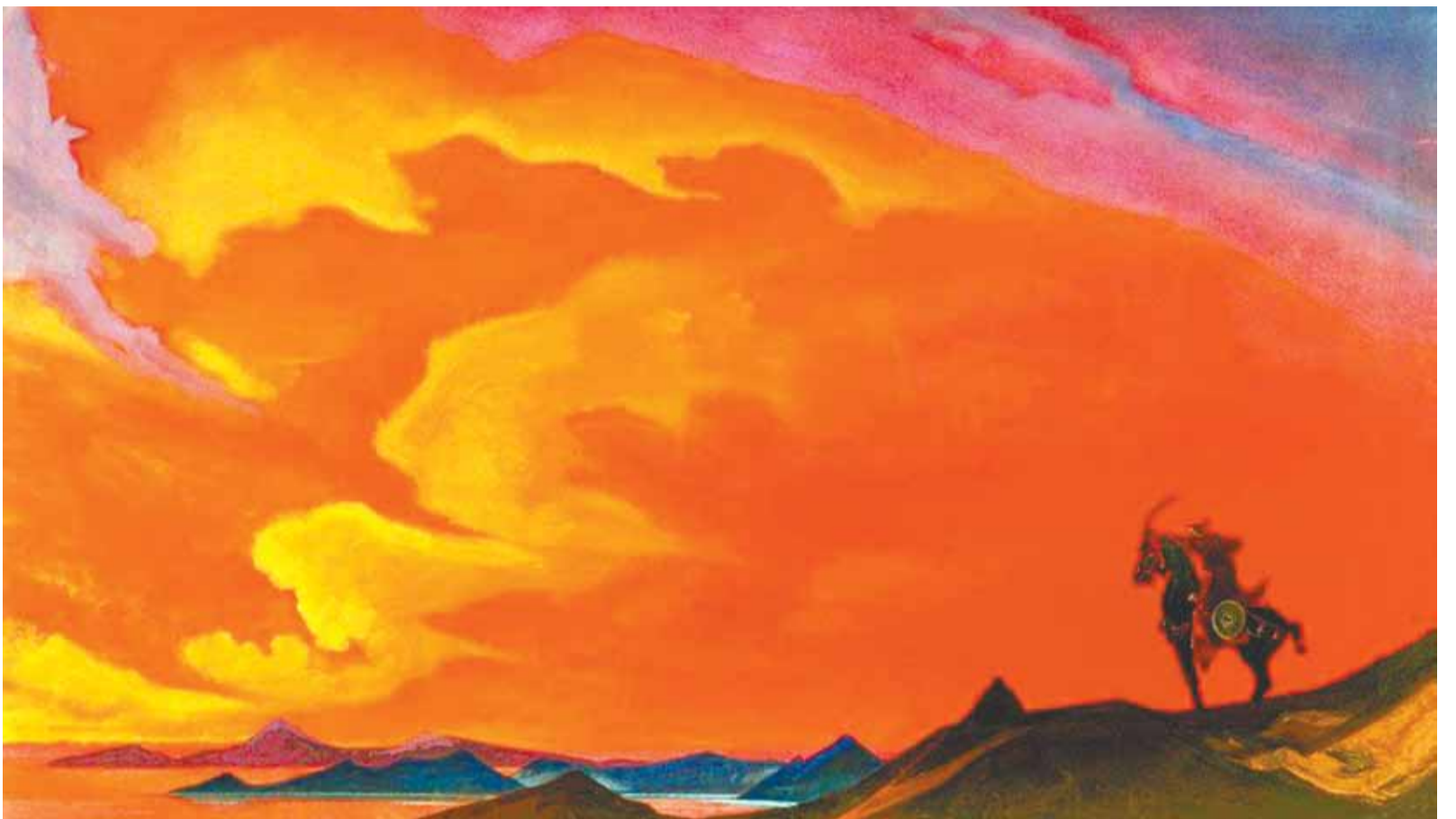
“Geser Khan,” a painting by Nicholas Roerich.

The Heart of Asia expedition was prepared by Roerich Society of Astana and is devoted to the 550th anniversary of the Kazakh Khanate and the 80th anniversary of the Roerich Pact.