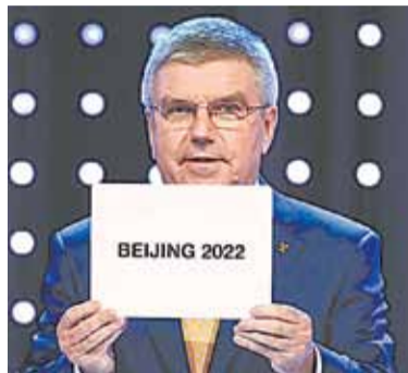
IOC President Thomas Bach announced the IOC decision on July 31.

This was an historic day for Kazakhstan and the International Olympic Committee because it was the first time only two cities remained for the final choice.