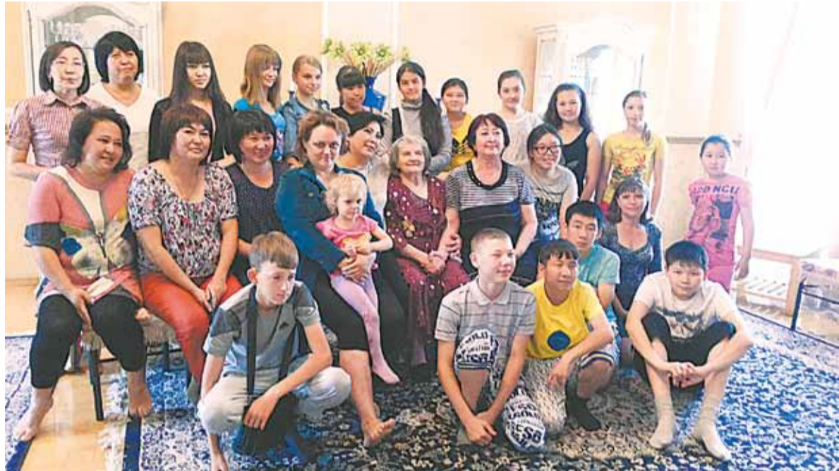
Visitors, volunteers, neighbours, orphans and good friends of the homecare.