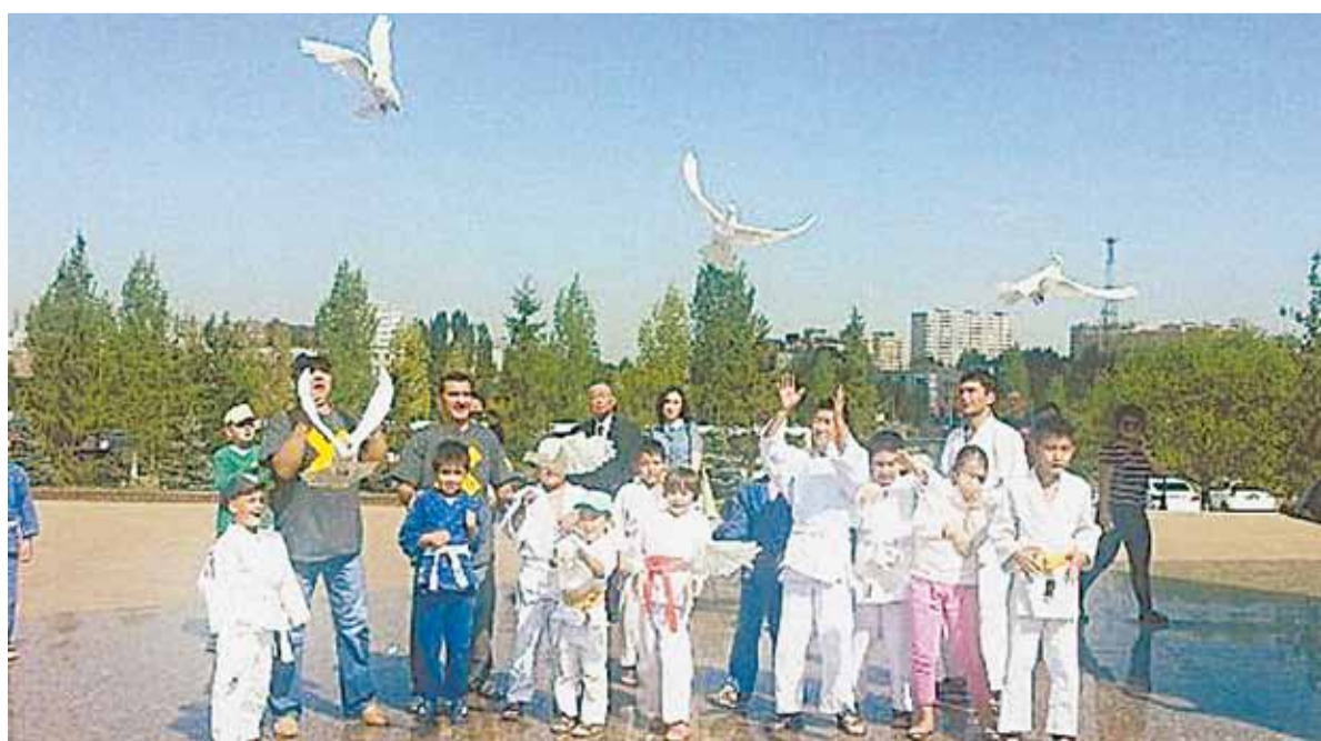
Members of Astana's judo clubs and representatives of The ATOM Project release white doves in commemoration of the victims of the Hiroshima bombing 70 years ago on Aug. 6.

The event ended with the children laying flowers at the eternal fire and releasing seven balloons and seven white doves into the air as a sign of peace on Earth.