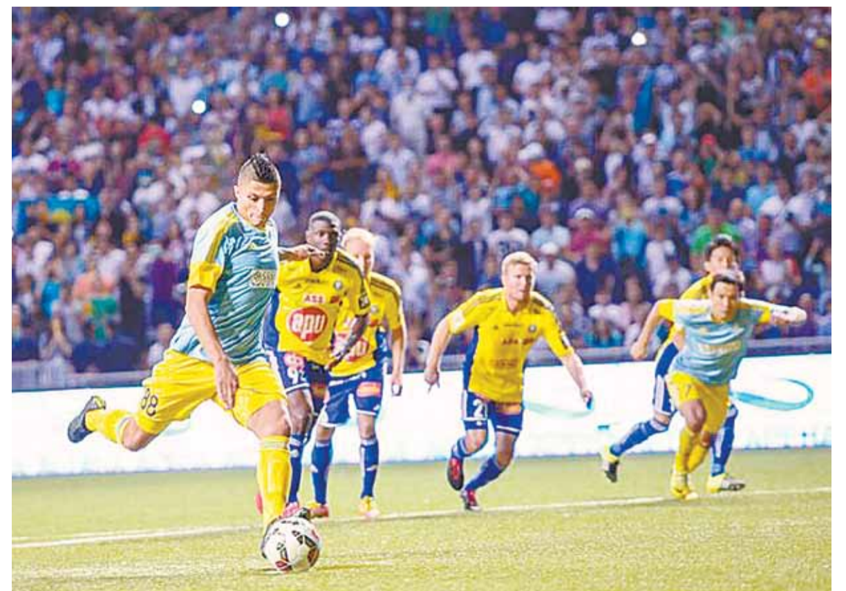
FC Astana beat HJK from Finland in a nailbiting match on Aug. 5 ending 4-3. Read the full story on Page B7.