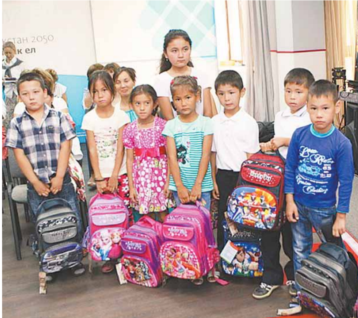
The children who have been helped to get ready for the upcoming school season by "The Road to School" charity campaign.