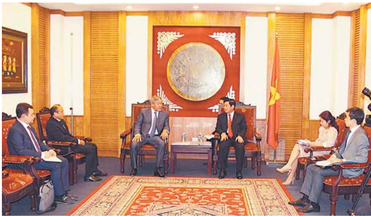
Kazakh First Deputy Foreign Minister Rapol Zhoshybayev (L) and Deputy Minister of Culture, Sports and Tourism Huynh Vinh Ai discuss ongoing progress in preparations for EXPO 2017.

The visit included a review of co-operation in cultural and humanitarian areas. Speaking with Son, Zhoshybayev commended Vietnam's achievements in executing social and economic reforms and developing a viable market economy.