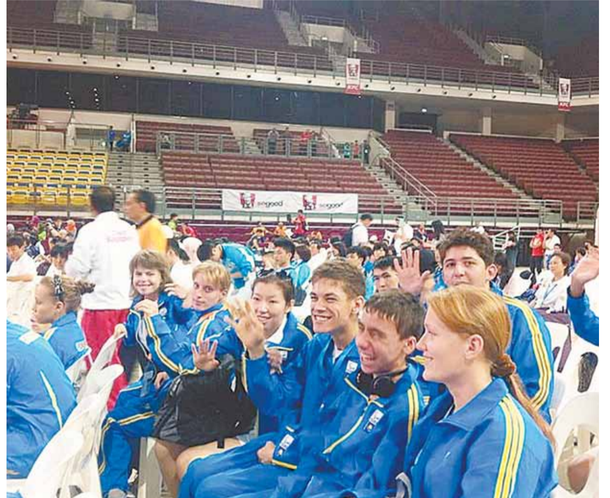
Fans, friends and relatives greeted the Kazakh Special Olympics team back in their homeland with honours and special attention.

The Games were founded in 1968 and are held every four years under the motto "Let me win, but if I cannot win, let me be brave in the attempt."