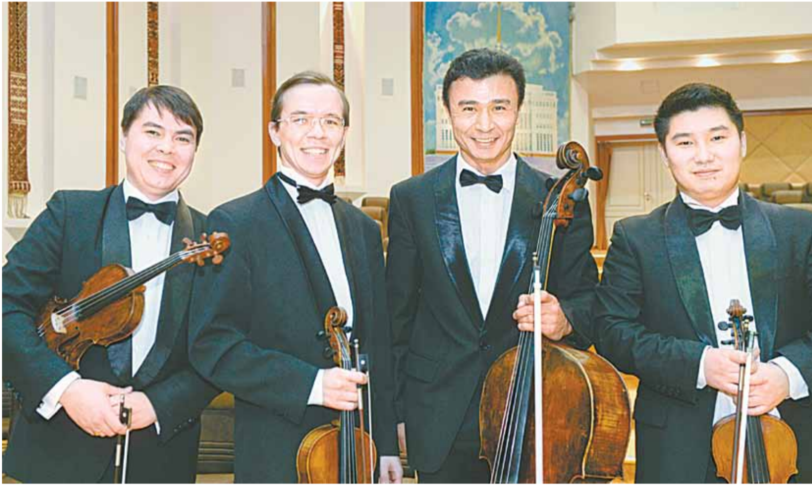
The Gaziza Zhubanova State String Quartet performing concert at the Nazarbayev Centre.

The beauty of the concert, including the stings conveying the sounds of the oboe, horn, organ and harp, earned the performers hearty applause and numerous bravos from the audience.