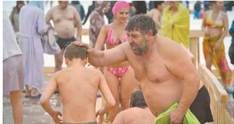
Thousands of Astana residents flocked to the Yessil River for Russian Orthodox Epiphany.