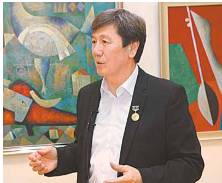
Sultan Ilyayev's "Repetition" exhibition is held in Astana for the first time.

Many of his works are monuments and mosaics. For example, "Zhibek Zholy" (Silk Way) complex in South Kazakhstan's ancient city of Sairam reflects the national identity and the "Altyn Agash"