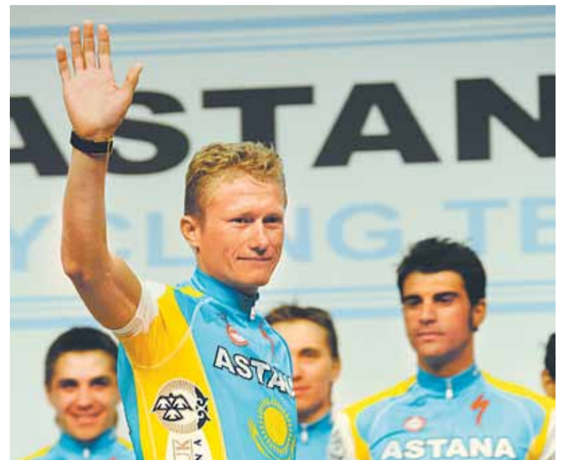
London Olympics 2012 gold medalist and Astana Pro Cycling Team manager Alexander Vinokourov