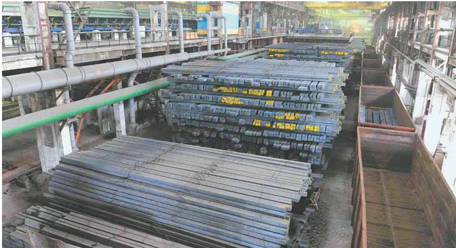
According to KAZNEX INVEST, priority export industries will include metallurgy, the chemical sector and food production.

"In the new strategy, we have taken into account these factors. The plan consists of three main