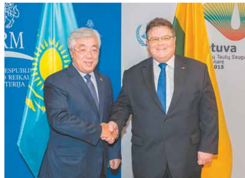
Foreign Ministers Erlan Idrissov and Linas Linkevicius signed a plan of action to promote bilateral ties in Vilnius on Jan. 27.

The introduction of a visa-free regime with Schengen area states is not an easy issue and requires extensive coordinative procedures, signing a range of bilateral and