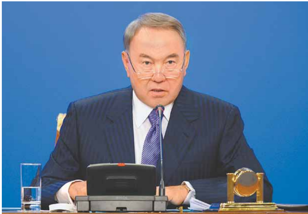
President Nazarbayev delivers his state-of-the-nation address on Jan. 17 at the Palace of Independence.

Among the specific goals to be achieved by 2050 were at least a 4 percent annual growth in gross domestic product (GDP), an increase in investment from the current 18 percent to 30 percent of the