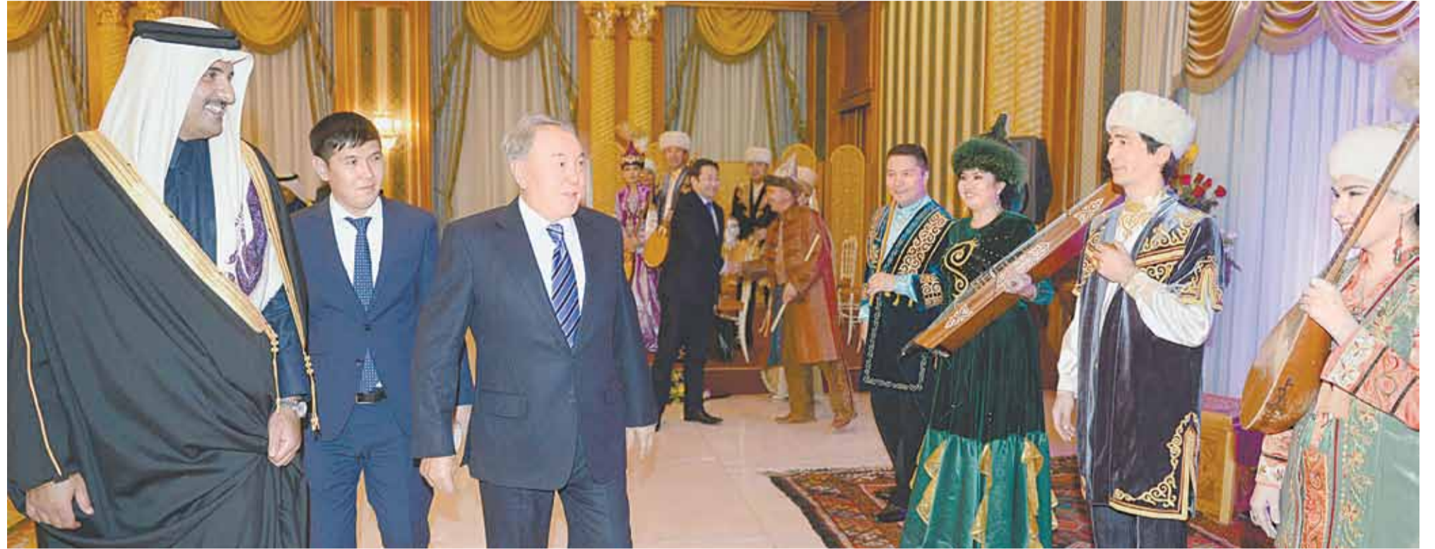
President Nazarbayev and Emir Tamim bin Hamad bin Khalifa al Thani meet with musicians following a small concert.