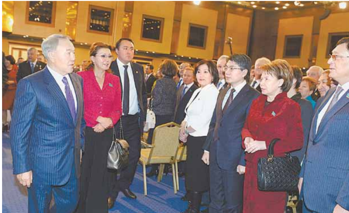
President Nazarbayev speaks to invited attendees after his address.

“We need to develop the logistics services sector,” the President continued. “First of all, it is a question of the maximum use of the Customs Union territory for transportation of our goods. Construction work on the Western Europe-Western China corridor is coming to an end. We have built a new railway to Turkmenistan and Iran, with