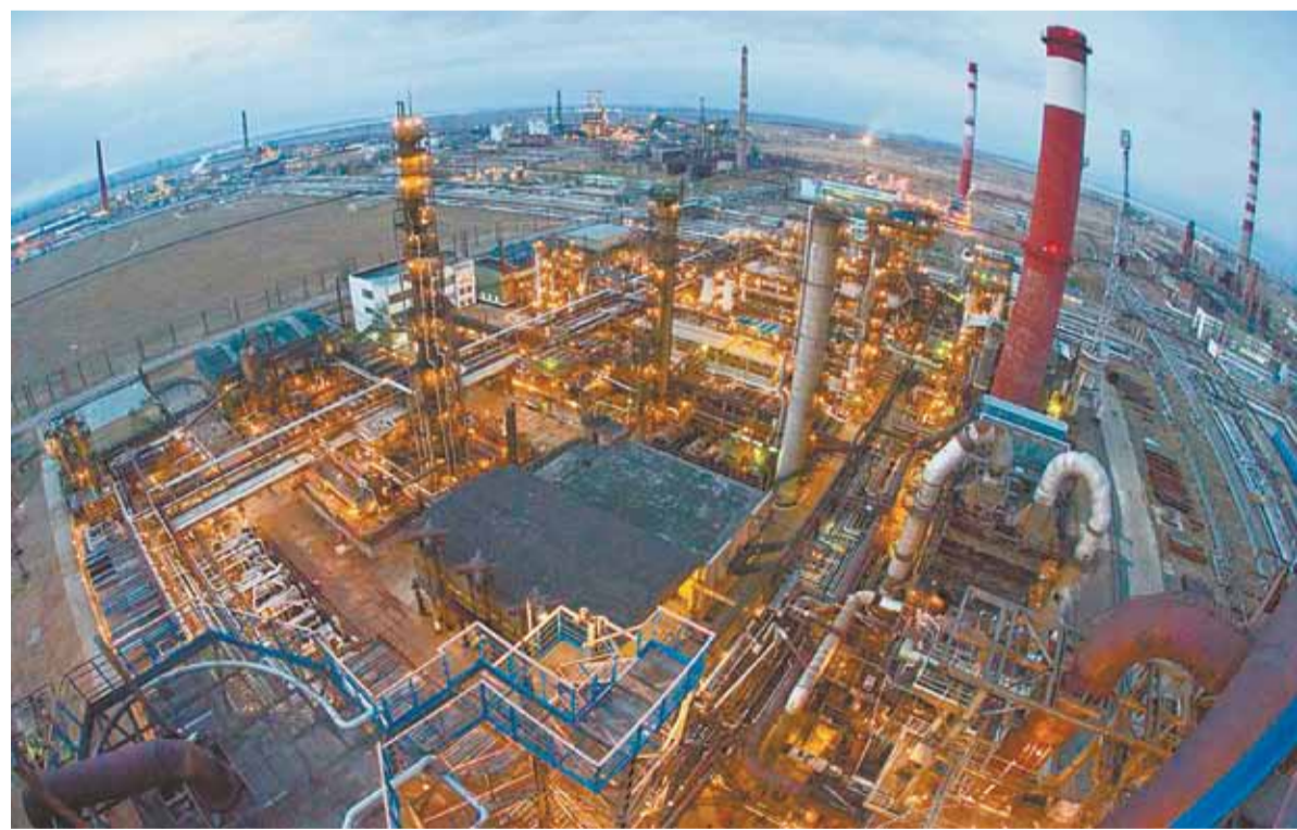
The Pavlodar Petrochemical Plant refined 5.09 million tonnes of oil in 2013, 1.8 percent more than the previous year.

The updated equipment and improved production management allowed the plant to refine 5.09 million tons of oil in 2013, 1.8 percent more than the previous year. The company hopes to reach an annual refining volume of 7 million tons and to start producing Euro 4 and Euro 5 fuels by 2016.