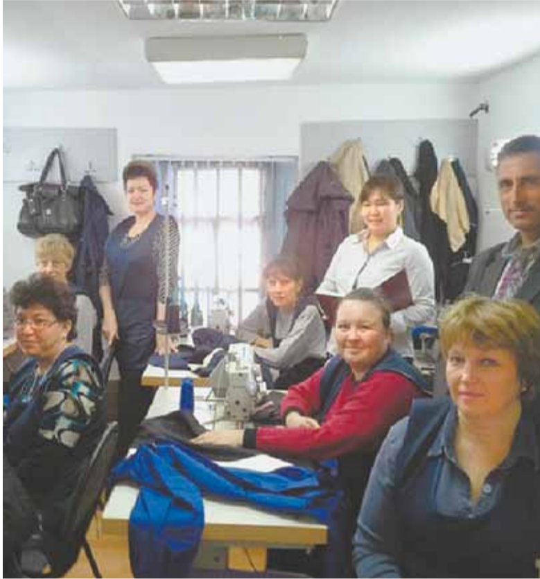
The family shop, with its modern sewing equipment, produces about 1,600 items monthly.