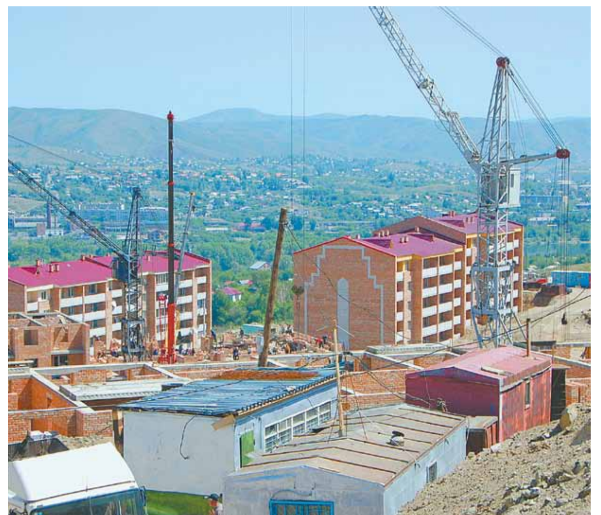
A school is built in Kyrgyzstan under an agreement with its northern neighbour.

The agreement was signed during the official visit of President Nazarbayev to the Kyrgyz Republic in August 2012.