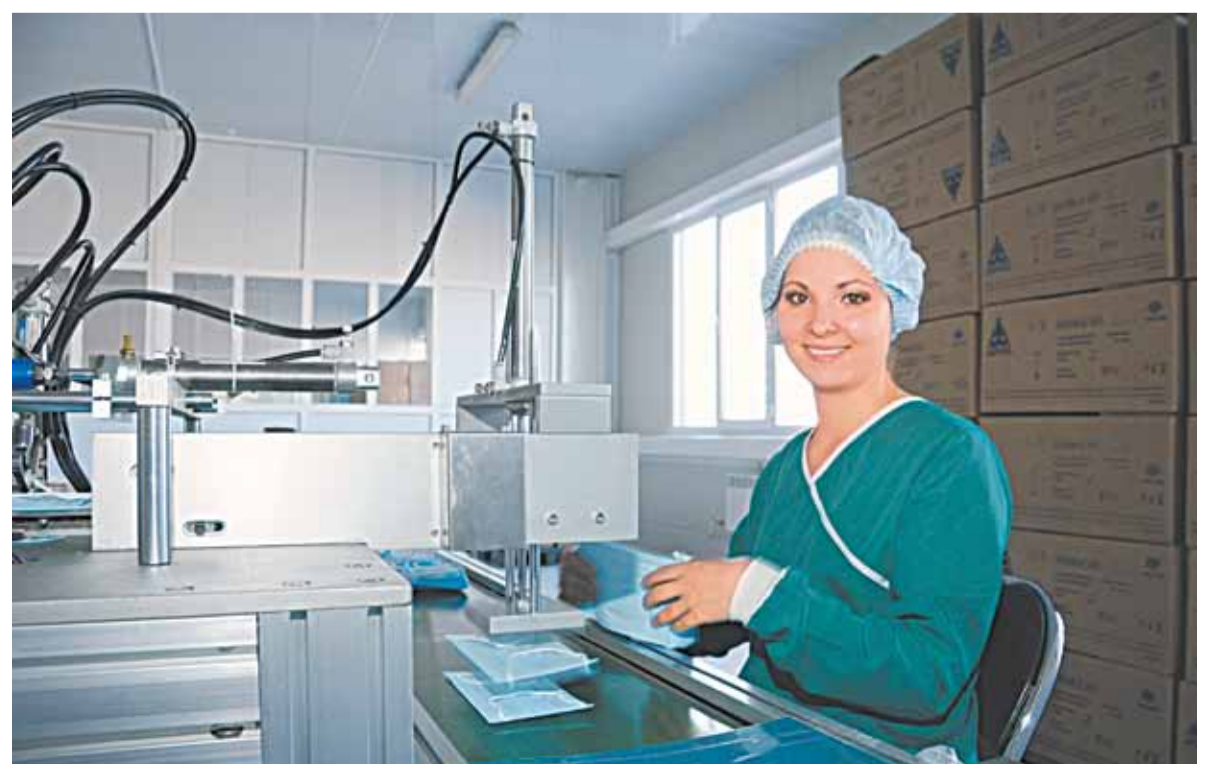
A new pharmaceutical manufacturing plant in the village of Aisha Bibi is providing jobs for 16 local residents.

The company also hopes that its disposable clothing will help protect medical workers from AIDS, hepatitis and other dangerous infections because it is made from high-quality Russian and Belarusian non-woven material with improved barriers against infection.