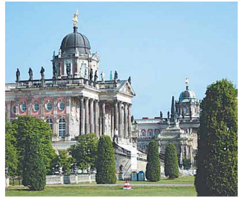
Potsdam University is considered one of Europe’s best higher education institutions in the field of public administration and management.

Seminars and lectures were delivered by the leading lecturers of Potsdam University, which is considered to be among Europe’s best higher education institutions in the field of public administration and management. Scholars shared their experiences in teaching and conducting research on public policy and public administration.