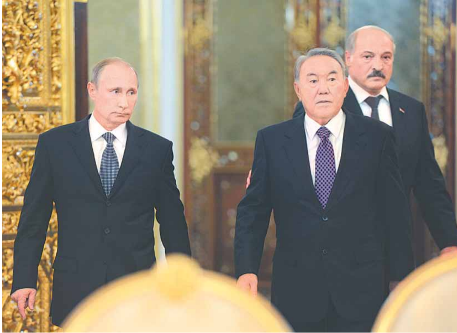
Presidents Vladimir Putin of Russia, Nursultan Nazarbayev of Kazakhstan and Alexander Lukashenko of Belarus met in Moscow on Dec. 24 as part of the Supreme Eurasian Economic Council. They discussed the directions of integration among three member states of the Customs Union and the Common Economic Space, as well as progress on the formation of the Eurasian Economic Union by the scheduled date of Jan. 1, 2015. They also discussed issues on preparation and implementation of the road maps on Kyrgyzstan and Armenia's accession to Eurasian integration structures. Following the meeting, several joint decisions on a common customs policy, regulation of natural monopolies activity and competition rules took place were signed. President Nazarbayev also had a bilateral meeting with President Putin as the two leaders signed an agreement on cooperation in the military-technical sphere and oversaw the signing of several other bilateral documents relating to joint use of the Baikonur Cosmodrome and to the transit of Russian oil through Kazakhstan to China.