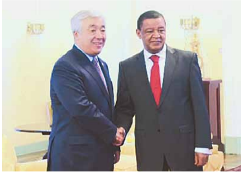
Minister of Foreign Affairs Erlan Idrissov (l) and President of Ethiopia Mulatu Teshome (r) discussed issues of expanding mutual trade and investment.

Trade between Kazakhstan and Guinea in 2010 was extremely low, which the Kazakhstan foreign ministry attributes to the lack of contact between the business communities of the two countries, as well as a lack of direct transport routes. Guinea, however, has rich reserves of diamonds, gold and other valuable minerals. Diplomatic relations between Kazakhstan and Guinea were established on April 4, 1992; however, economic