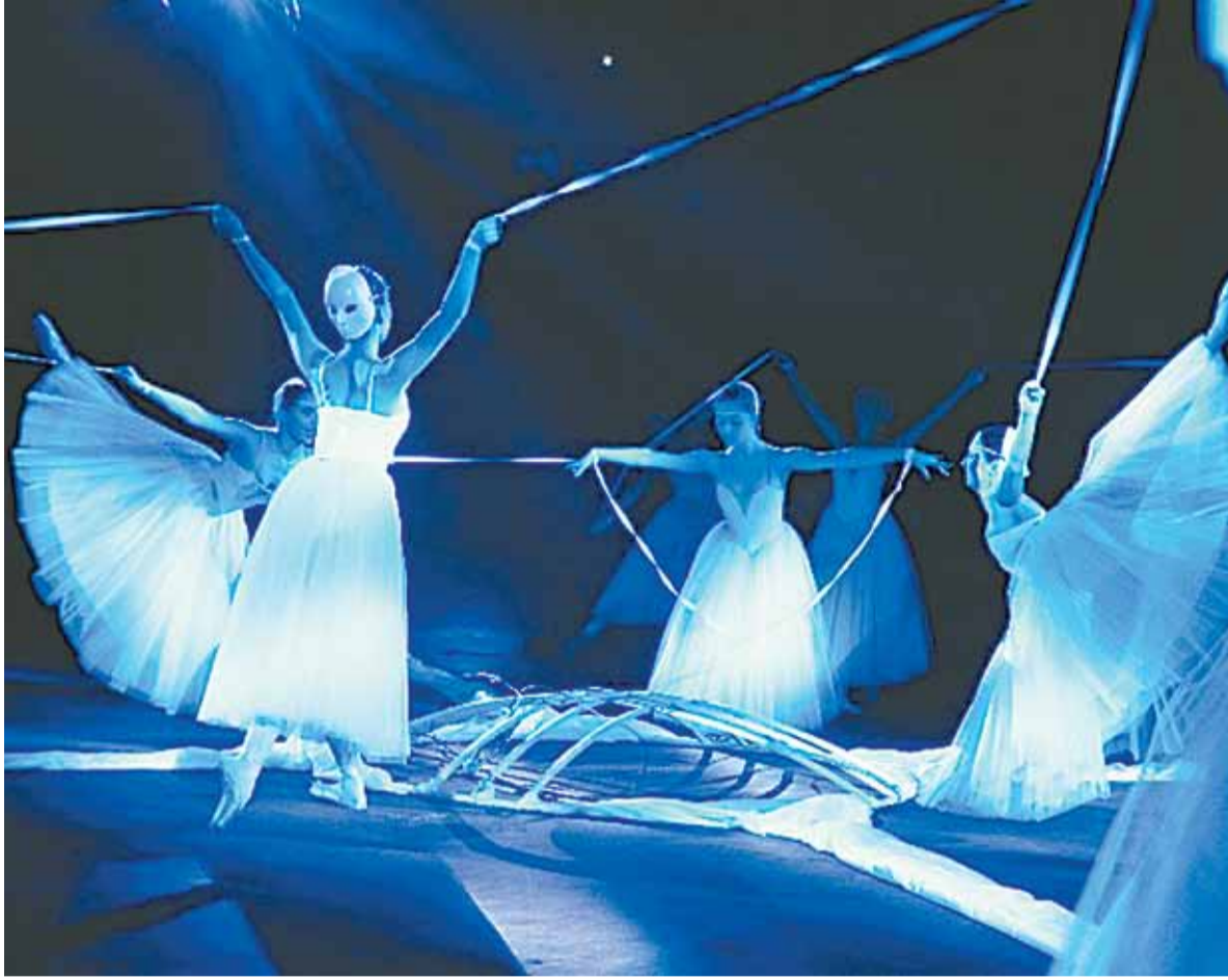
Gifted young people who participated in the Delphic Games impressed the jury with their abilities and their high potential.