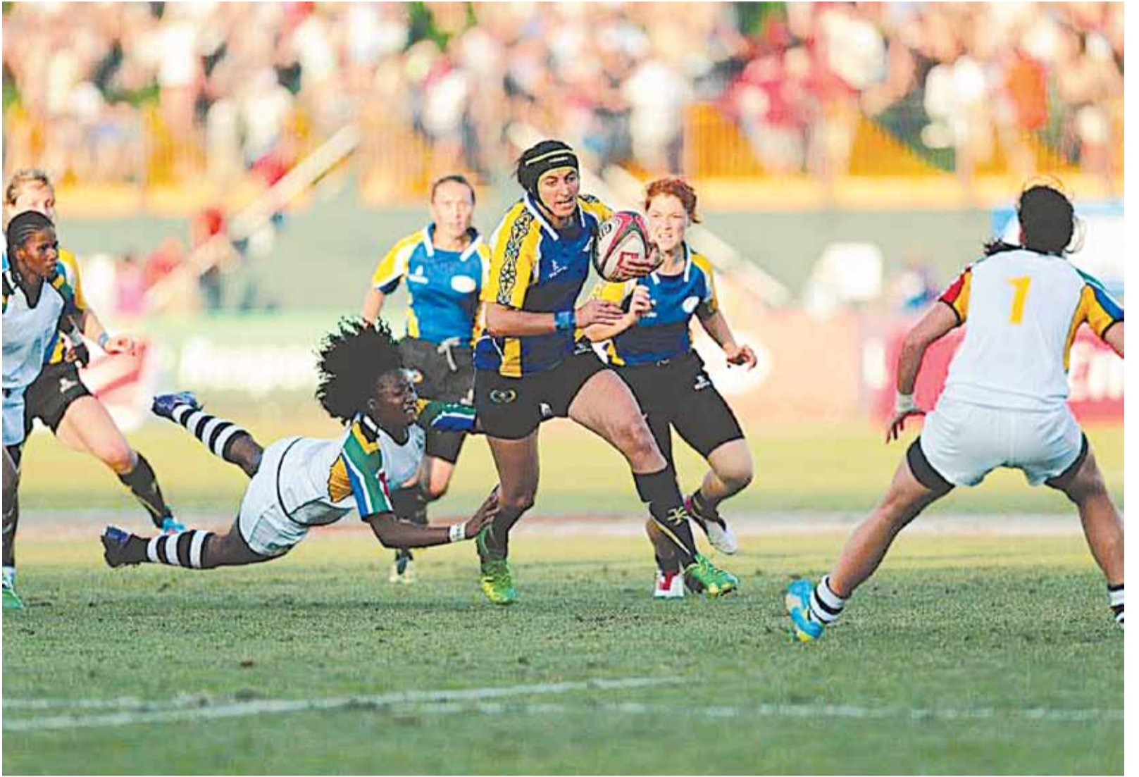
Hard work got Kazakhstan's national women's rugby team an anticipated victory.