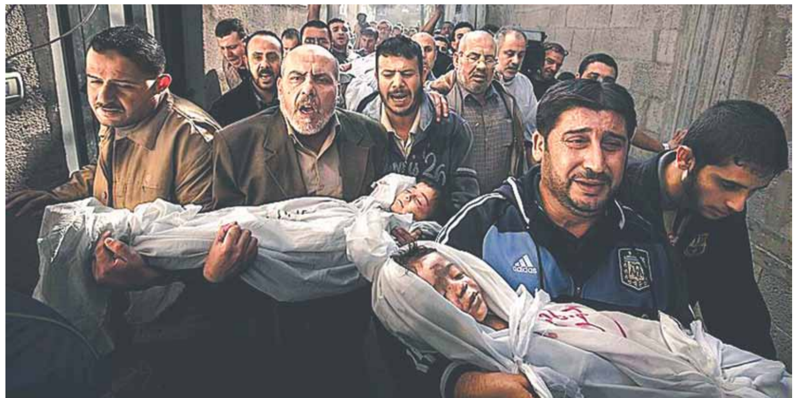
A photo by Paul Hansen, depicting the funeral procession of two little children killed during Operation Pillar of Cloud in Gaza, was recognised by the international independent jury as the 2012 World Press Photo of the Year.