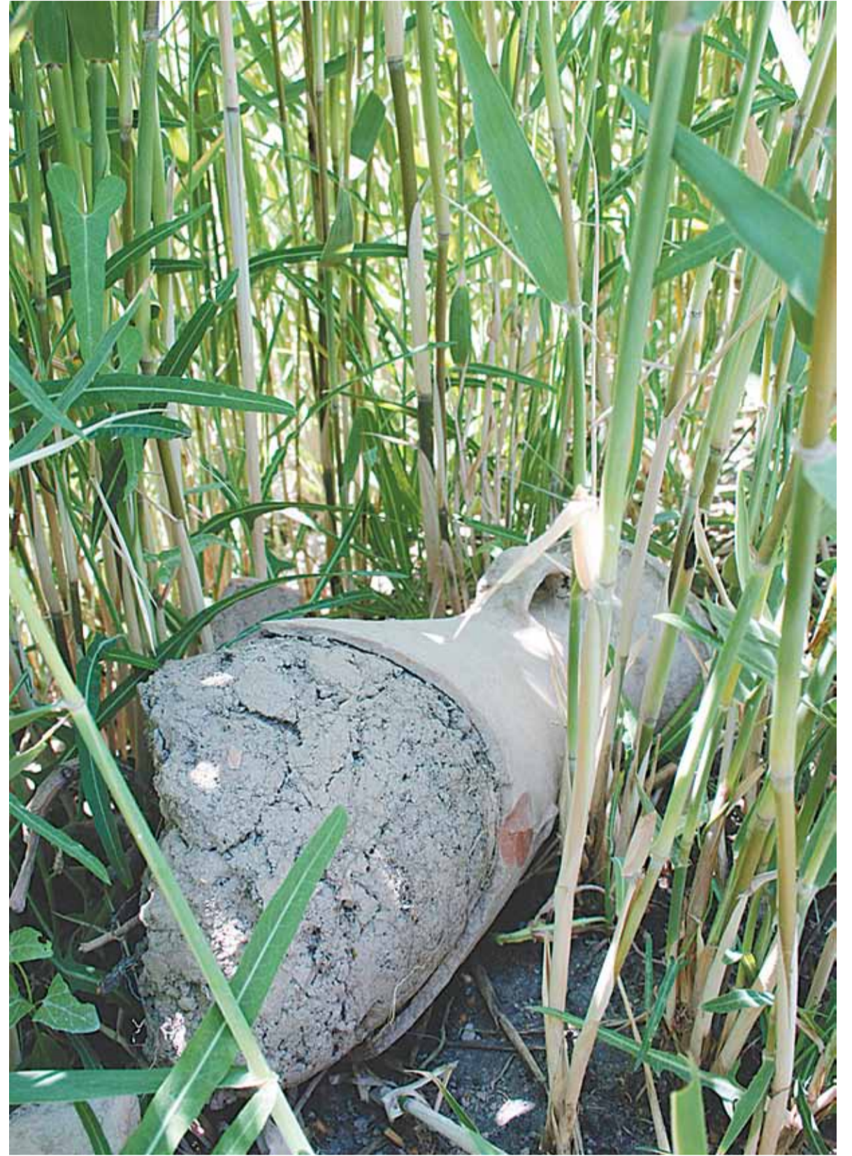
The pottery, human and animal remains, as well as a clay water pipeline were discovered at the Shardara Reservoir located 200 kilometres south-west from Shymkent.