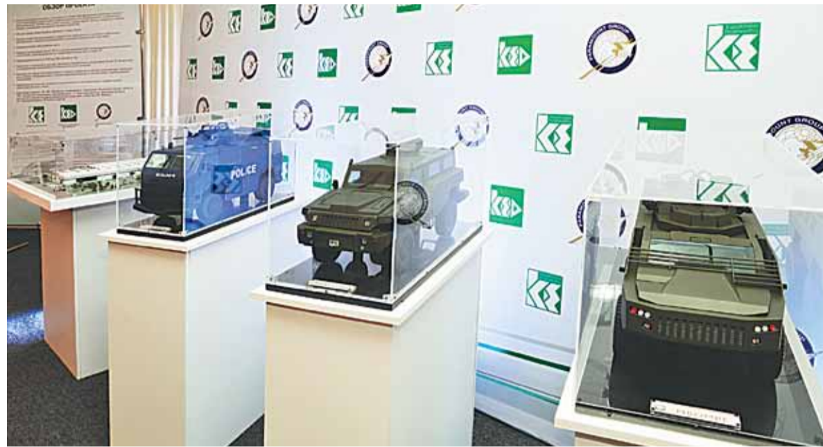
Specialised vehicles for military and civil purposes which are going to be manufactured at the new capital-based plant will meet international standards.