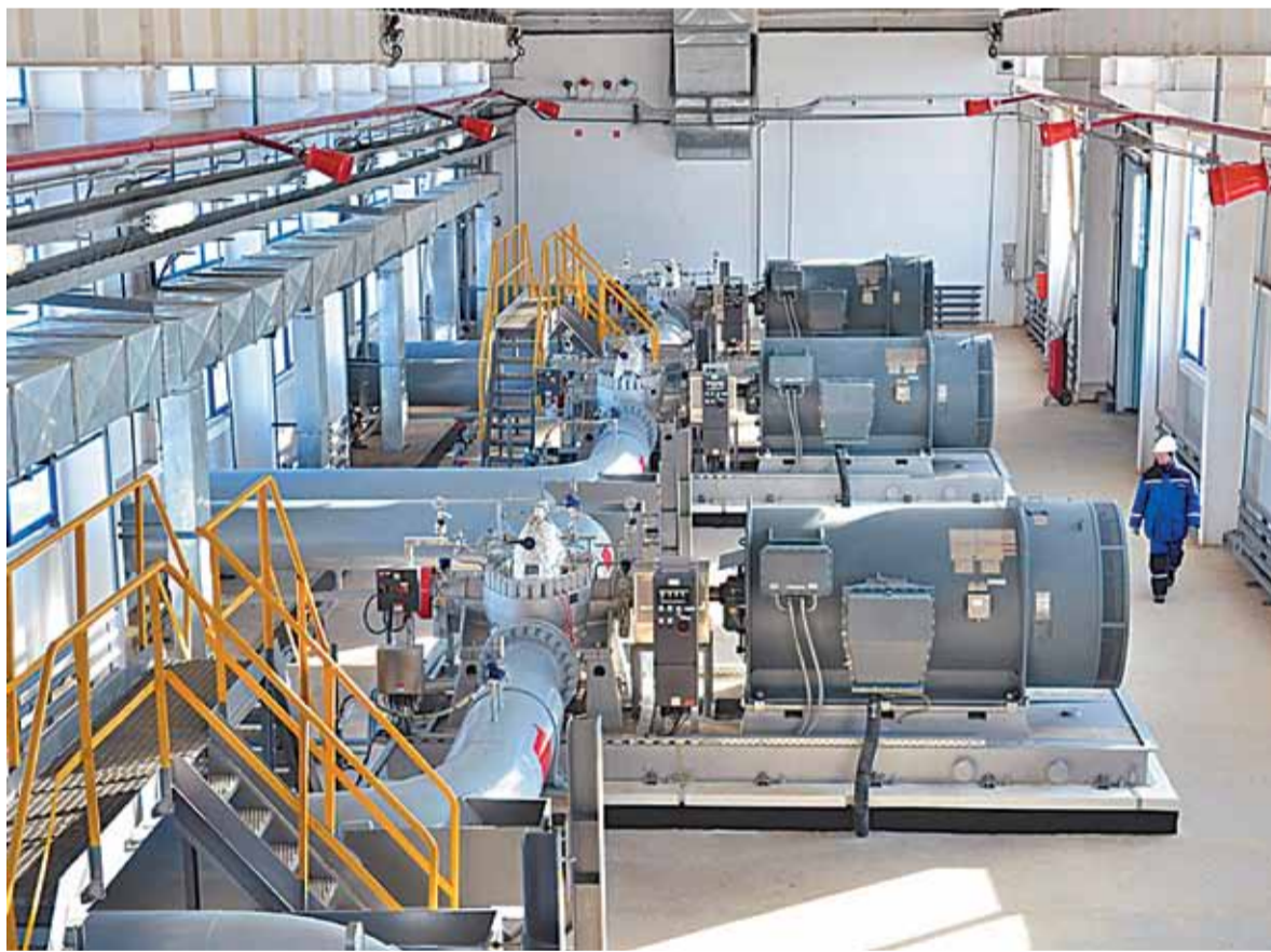
Two oil pumping stations No. 8 and No. 10 were put into operation to help the Atasu-Alashankou oil export pipeline to export 20 million tons of oil to China per year.

Also, 124 new jobs have been created at the new stations. Most employees are local residents.