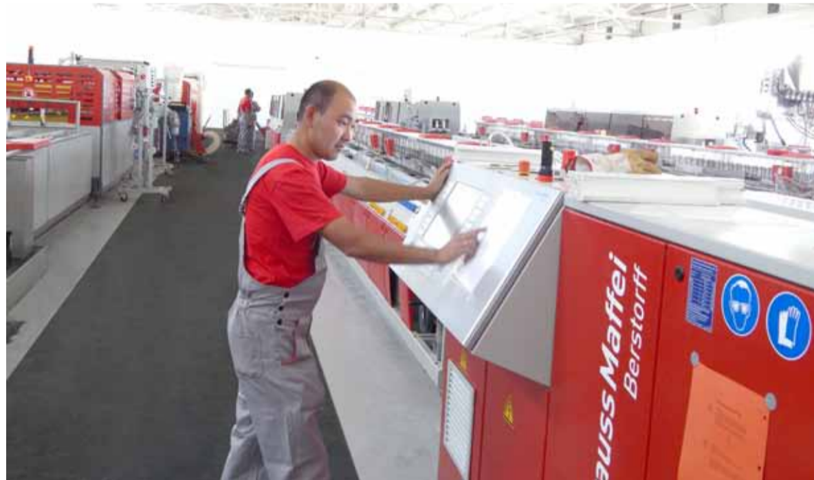
A worker of Baltexile LLP mans imported machinery at the factory in Shymkent. Baltexile is one of the projects benefiting from the support of the regional government.