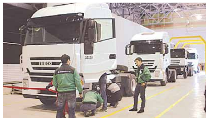
The production of Iveco's heavy trucks will bring modern industrial technologies in production engineering to Kostanay.

The production of Iveco's heavy trucks will bring modern industrial technologies and high standards of design and production engineering to Kostanay and Kazakhstan in general.