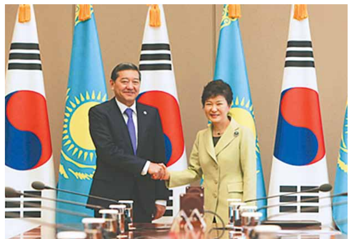
South Korean President Park Geon-hye (r) told Prime Minister of Kazakhstan Serik Akhmetov (l) that Kazakhstan is one of South Korea's main partners in the Eurasian space.