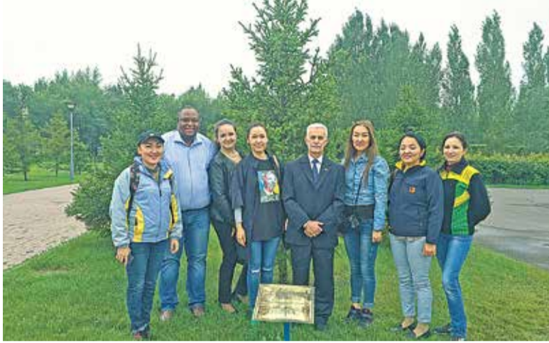
Embassy of South Africa in Kazakhstan staff.