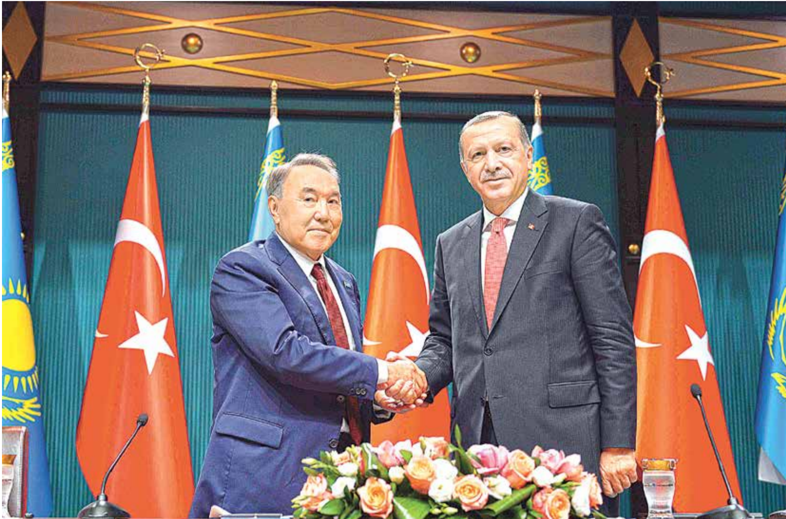
Kazakh President Nursultan Nazarbayev (L) and Turkish President Recep Tayyip Erdogan meet on Aug. 6 in Ankara.