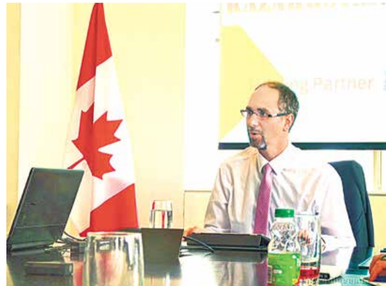
Ambassador of Canada to Kazakhstan Shawn Steil.

Kazakhstan was recently elected as a non-permanent member of United Nations Security Council. The ambassador states that "the platform that the country has put forward is similar to what Canada