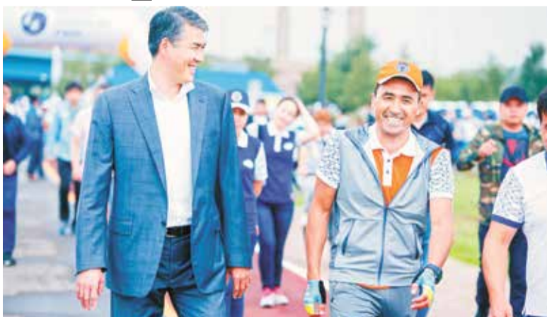
Astana Akim Asset Issekeshiev (L) and BI Group CEO Aidyn Rakhimbayev.

The mayor writes posts almost every day including local and foreign news. He shared reports July 22 about flooding in Astana, linking it to Kazakhstan's pouring rains which led to flooding in major cities. Issekeshiev indicated the government was exercising all efforts to resolve the issue and the flooded roads would soon be improved.