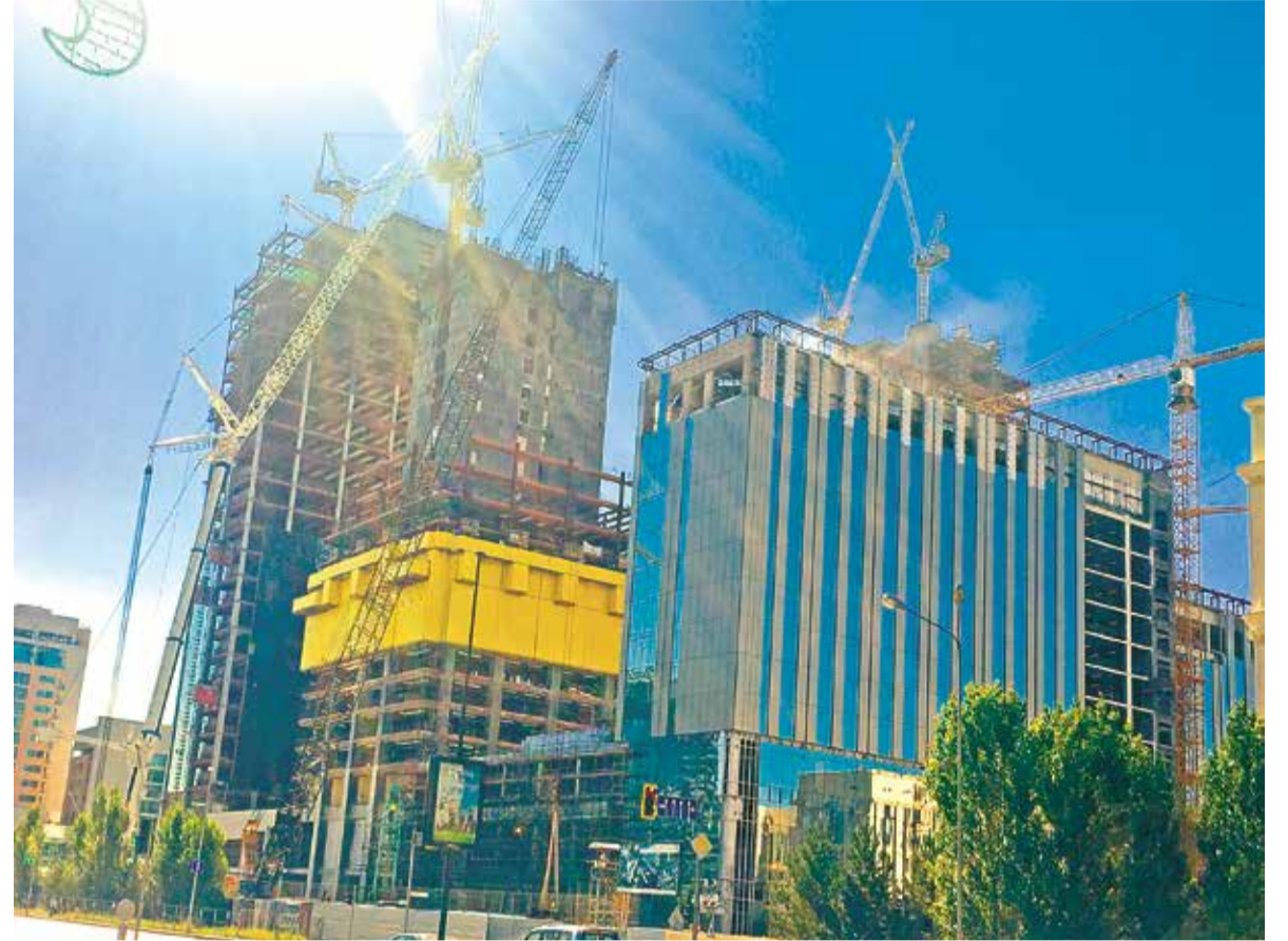
Abu Dhabi Plaza