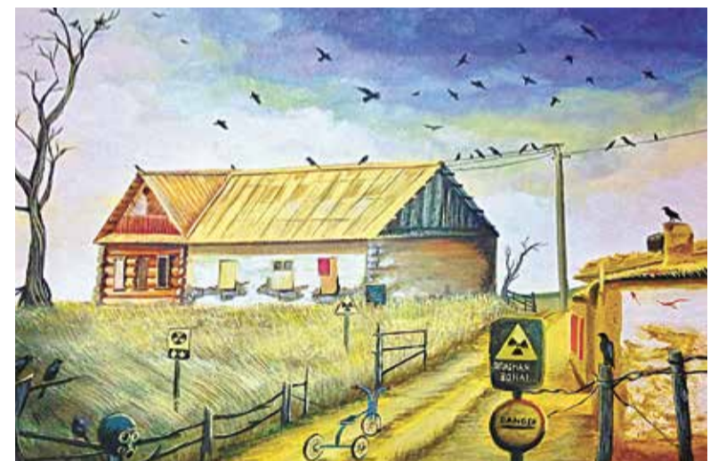
One of Kuyukov's works: Dead Zone.

"[Trade in] agricultural products, like cattle, genetics and meat is still increasing. We are relatively positive about that even though the numbers have dropped," the ambassador continued.