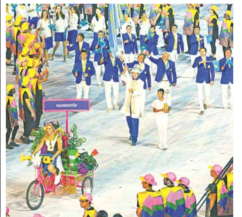
Read the full story on Page B7.