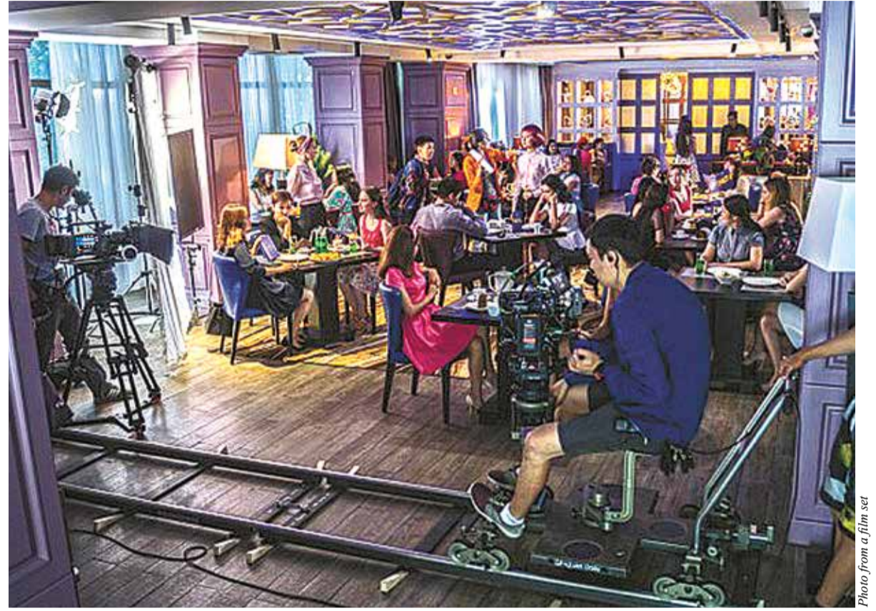
Photo from a film set